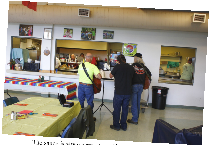
The sauce is always sweeter with a little music added. The music guys practicing while the kitchen crew sings along.