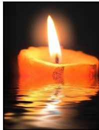
And of course..... Never forget....