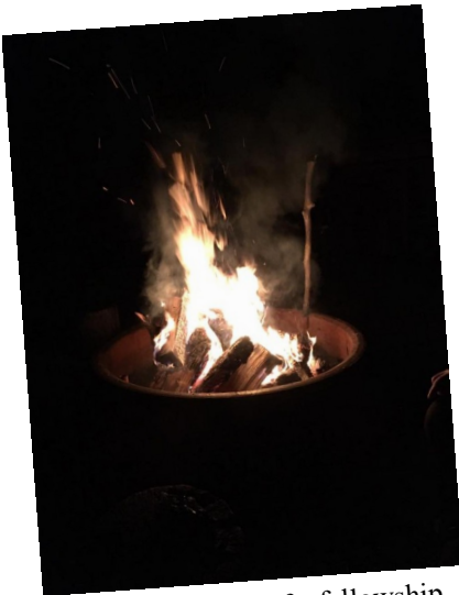
The warm glow of a fellowship fire greeted each morning.